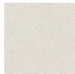
MD6001M 60x60cm 24"x24"