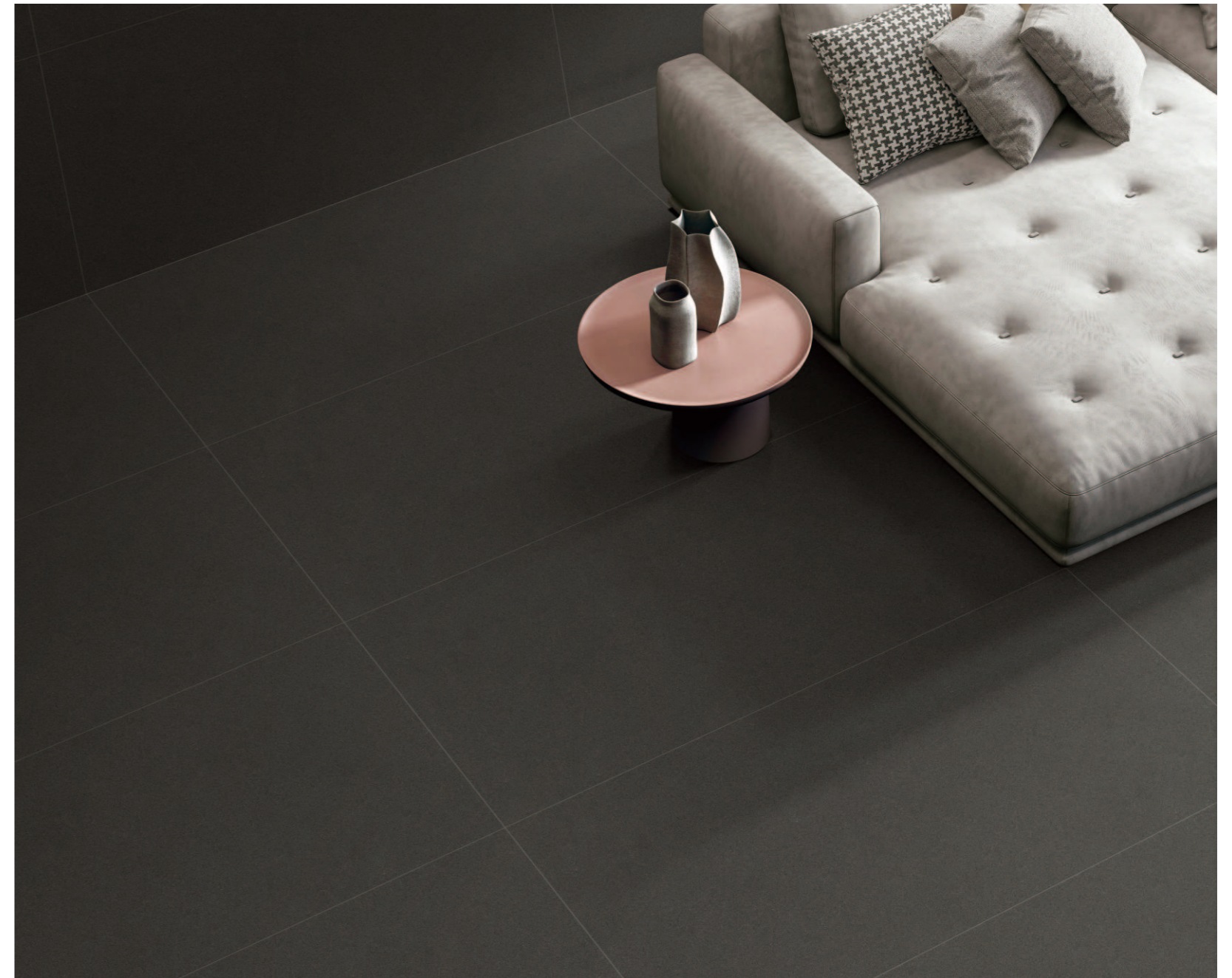
03 VOLCANIC BLACK