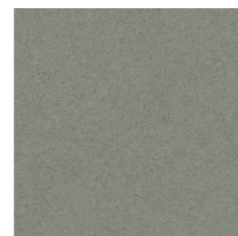
MD6002M 60x60cm 24"x24"