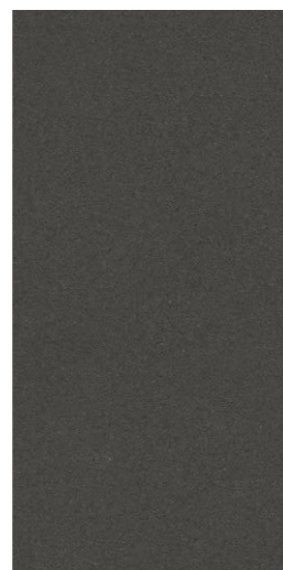
MD12603M 60x120cm 24"x48"